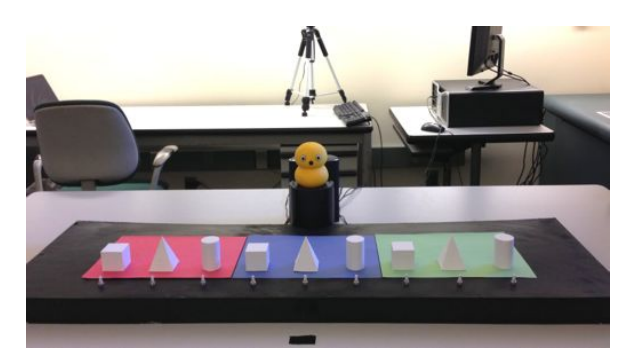
(a) Robot agent condition