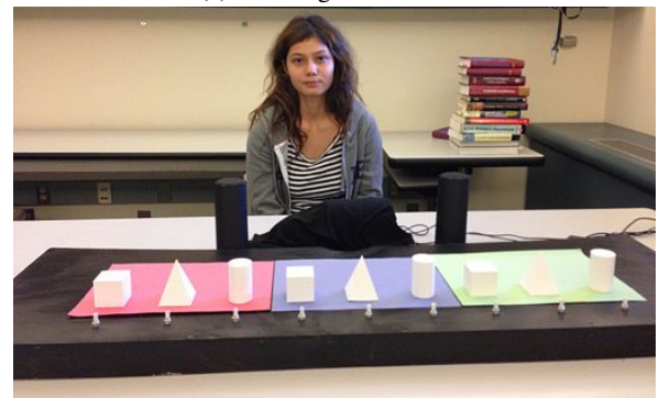
(b) Human agent condition

Figure 1: Participant view of the experiment. MyKeepon or a human actor provided verbal and gaze cues about which shape to select.